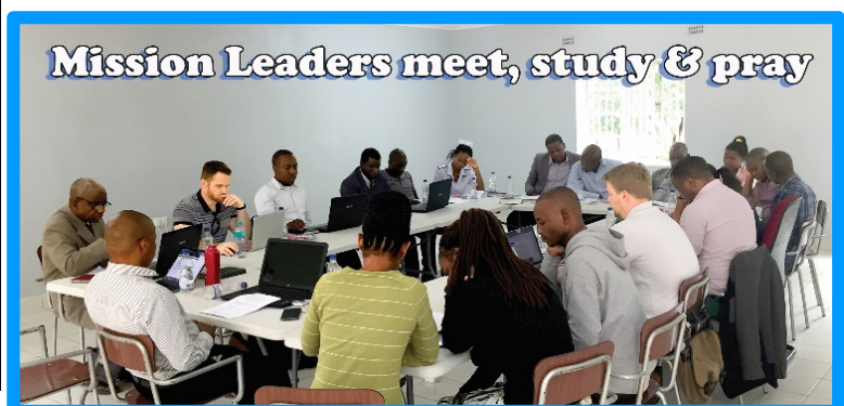
Mission Leaders meet, study & pray