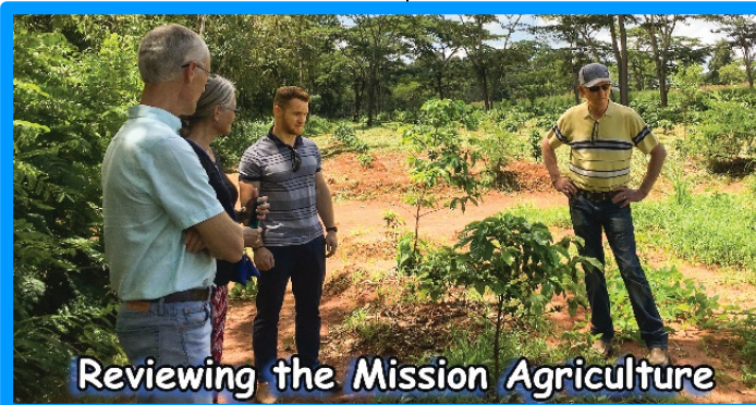
Reviewing the Mission Agriculture

They made us feel very welcome and we are so thankful for them and the Kingdom work they are doing.