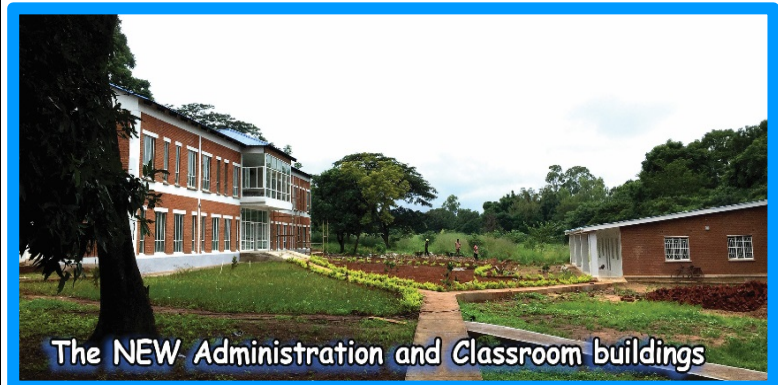
The NEW Administration and Classroom buildings