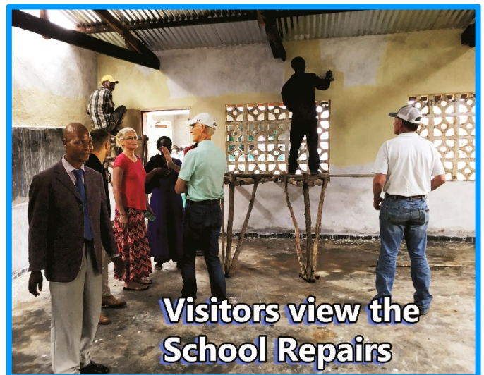
Visitors view the School Repairs