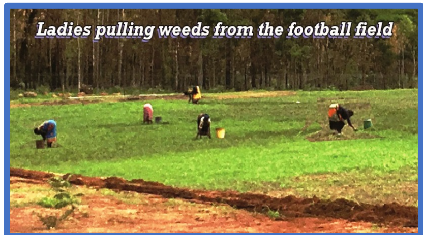
Ladies pulling weeds from the football field

Here are some things in Malawi's favor as they face the virus: