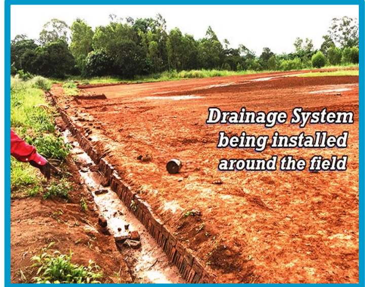
Drainage System being installed around the field