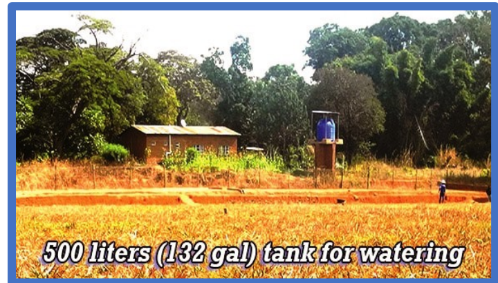
500 liters (132 gal) tank for watering