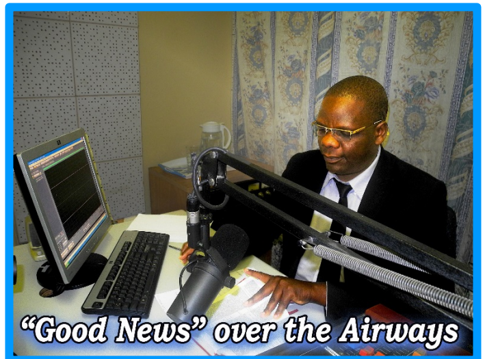
"Good News" over the Airways

We are thankful for the partnership with World Radio through White's Ferry Church in Louisiana. They have faithfully provided the air time for this program through the years.