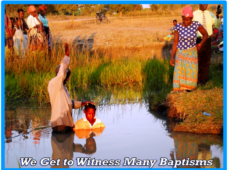
We Get to Witness Many Baptisms