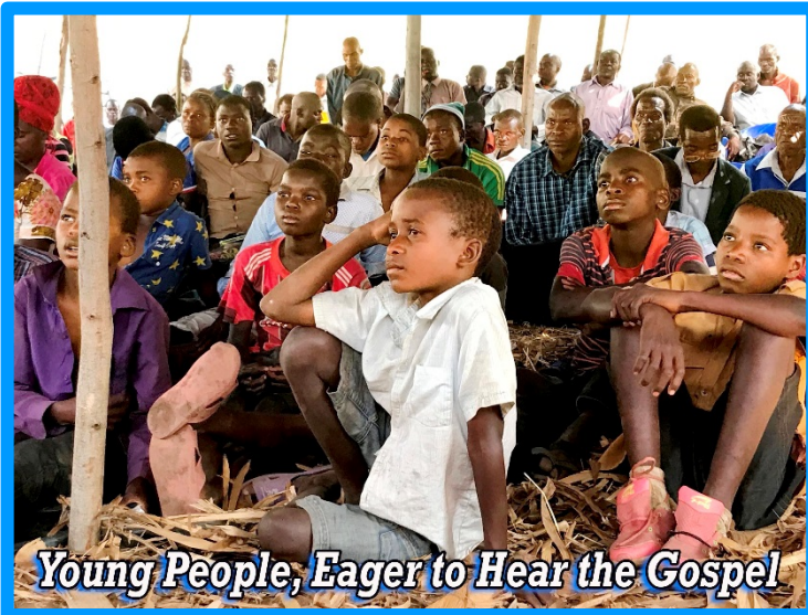
Young People, Eager to Hear the Gospel

God can do wonders with a seed planted in good hearts.