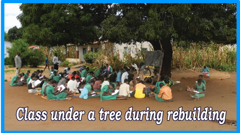
Class under a tree during rebuilding