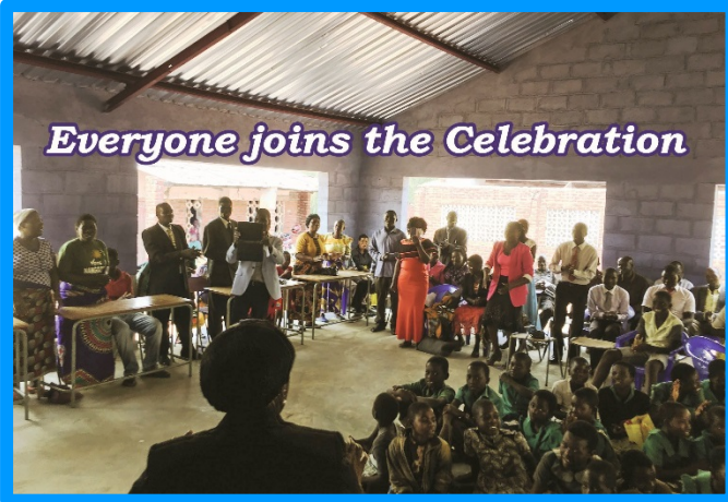
Everyone joins the Celebration

It was a great day. Everyone was excited to see the new school year open with such a special event and with a new structure. We are so grateful to the individuals, to Christian Relief Fund, East Side Church, and to I.D.E.S. for the contributions towards the school block. From our end, it's been gratifying to have the support of people who trust us and who believe in the work we are doing to provide this prompt response for help. This has been an excellent project in terms of the quality of the final product. We are very grateful as we consider the number of people this project has benefited. . . And thankful those blessings will long continue.