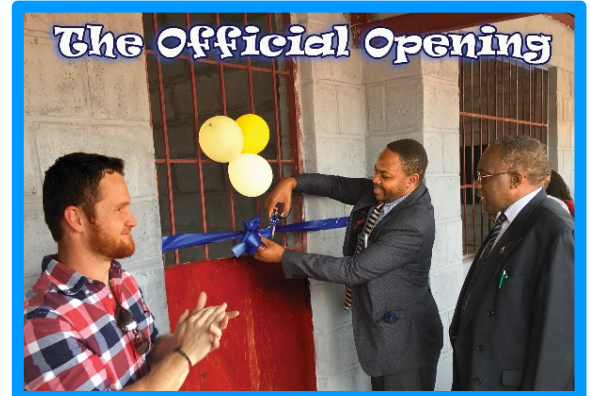
The Official Opening

He encouraged the students to study and to work hard in class, and he even promised those in standard eight (8 th Grade) that if they finish with high enough grades to be selected to a National Secondary School (High School), they will be given 20,000 Malawi Kwacha each. ($27, which is about three weeks' pay at minimum wage).