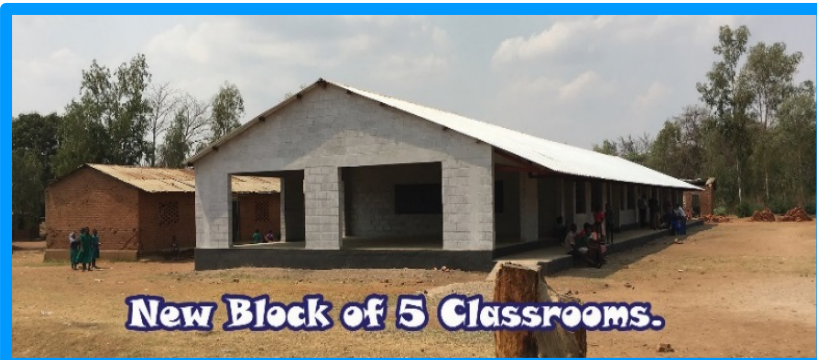
New Block of 5 Classrooms.