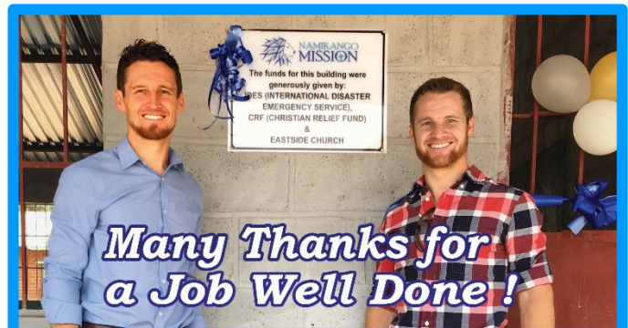
Many Thanks for a Job Well Done!