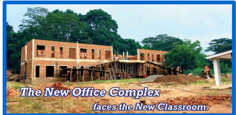
The New Office Complex faces the New Classroom.