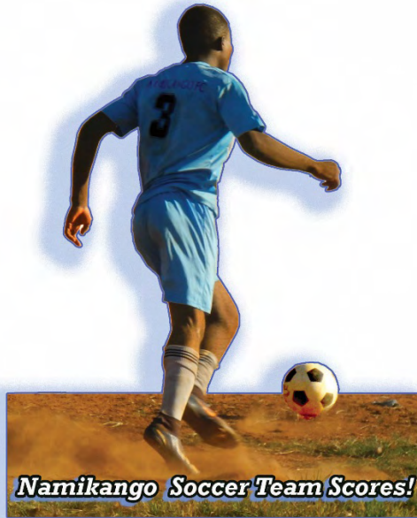
Namikango Soccer Team Scores!

NONPROFIT ORG U.S. POSTAGE PAID PERMIT NO. 764 Lubbock, Texas 79424