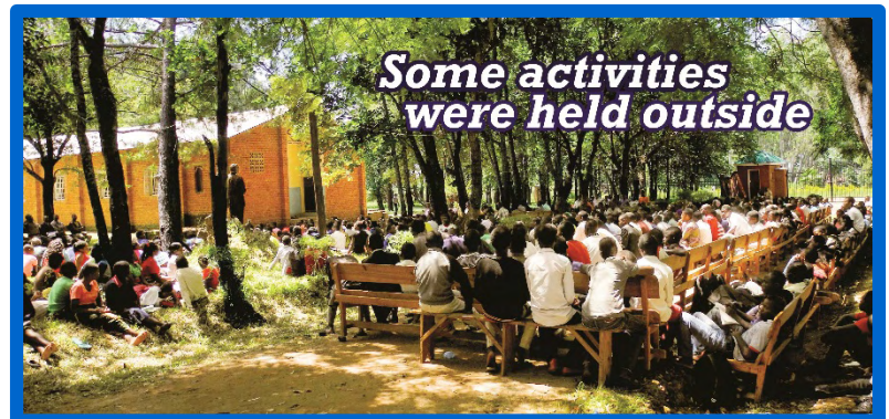
Some activities were held outside