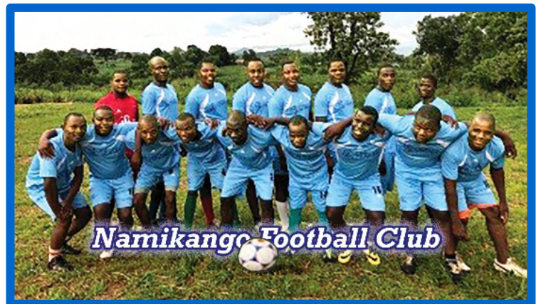
Namikango Football Club