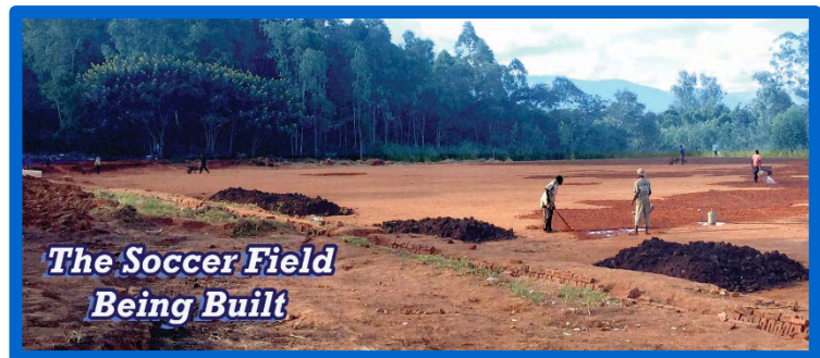
The Soccer Field Being Built