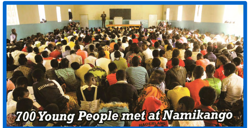
700 Young People met at Namikango

This was an encouraging event and the young visitors had a great time. The reports from our staff was that these young people were well disciplined and very eager to learn. The next youth event is already being planned for this coming May. It's good to see this increased focus on youth. This is the next generation of Jesus' followers being shaped in Jesus' image.