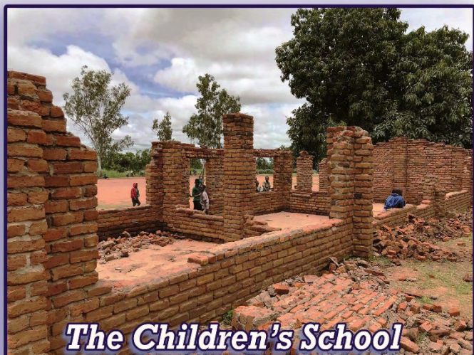
The Children's School Destroyed by High Winds

NONPROFIT ORG U.S. POSTAGE PAID PERMIT NO. 764 Lubbock, Texas 79424