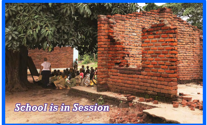
School is in Session