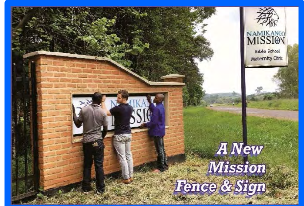
A New Mission Fence & Sign