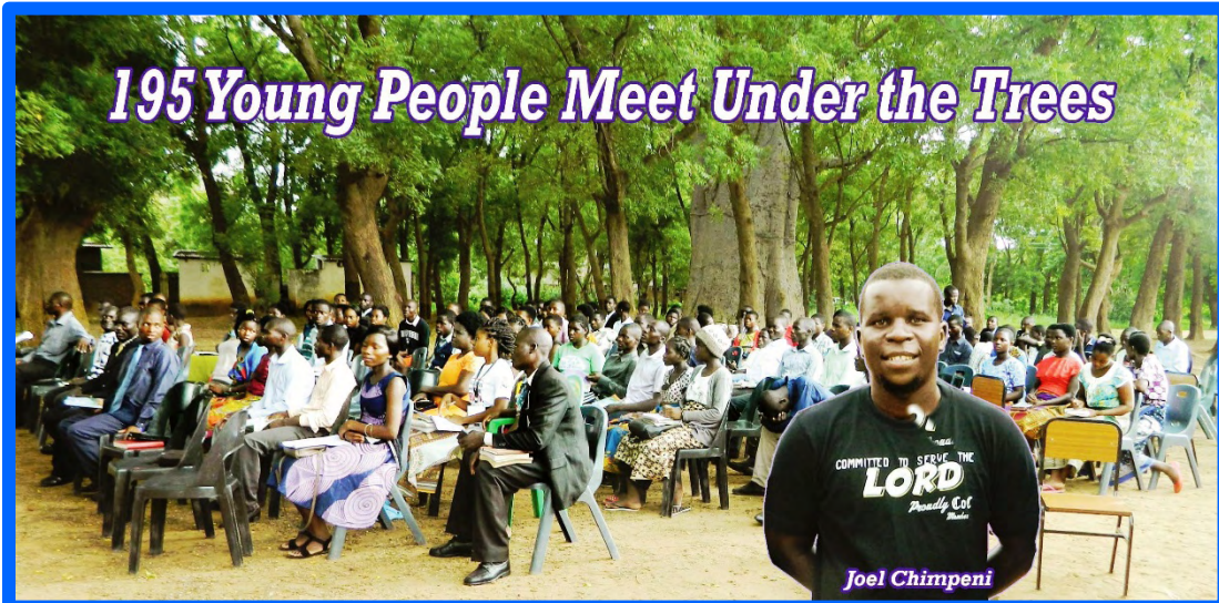
195 Young People Meet Under the Trees

Says, "I can do all things through Him..."