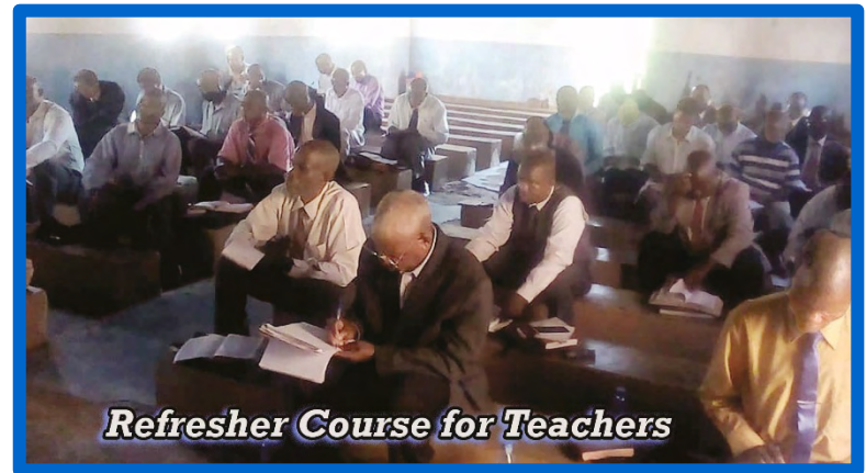
Refresher Course for Teachers

At the end of February, the Namikango Bible Team traveled to Mozambique to host the Annual Teacher Refresher Course in Milange. This annual meeting brings together all the Bible teachers who will be teaching in the Village Bible Schools in Mozambique.