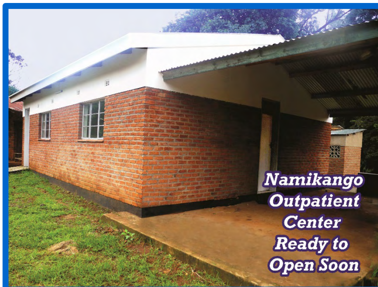
Namikango Outpatient Center Ready to Open Soon

After the course was completed, the team traveled to Milange and Gurue to talk with the new missionaries and to hand them over to the churches in an official capacity. It was with much joy that the churches received their men back, exclaiming, "We finally have missionaries!"