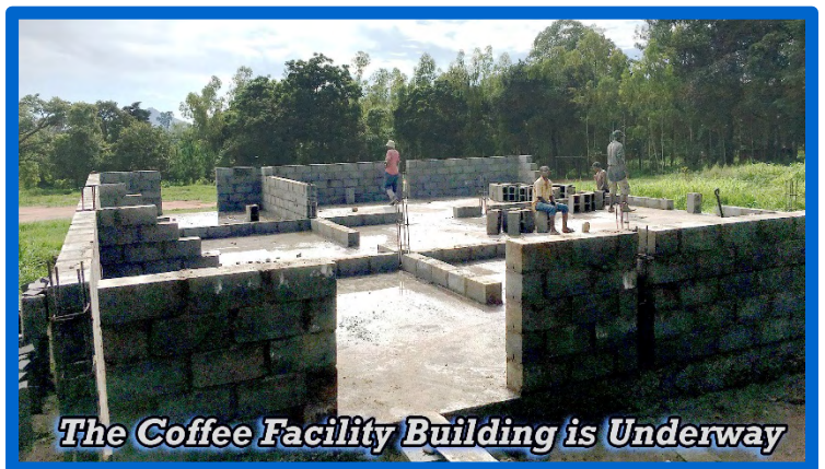
The Coffee Facility Building is Underway

Our goal with the coffee and with other projects is to provide a level of self-support for Namikango. We teach the people here to become self-reliant and we want to set an example for them. Ben