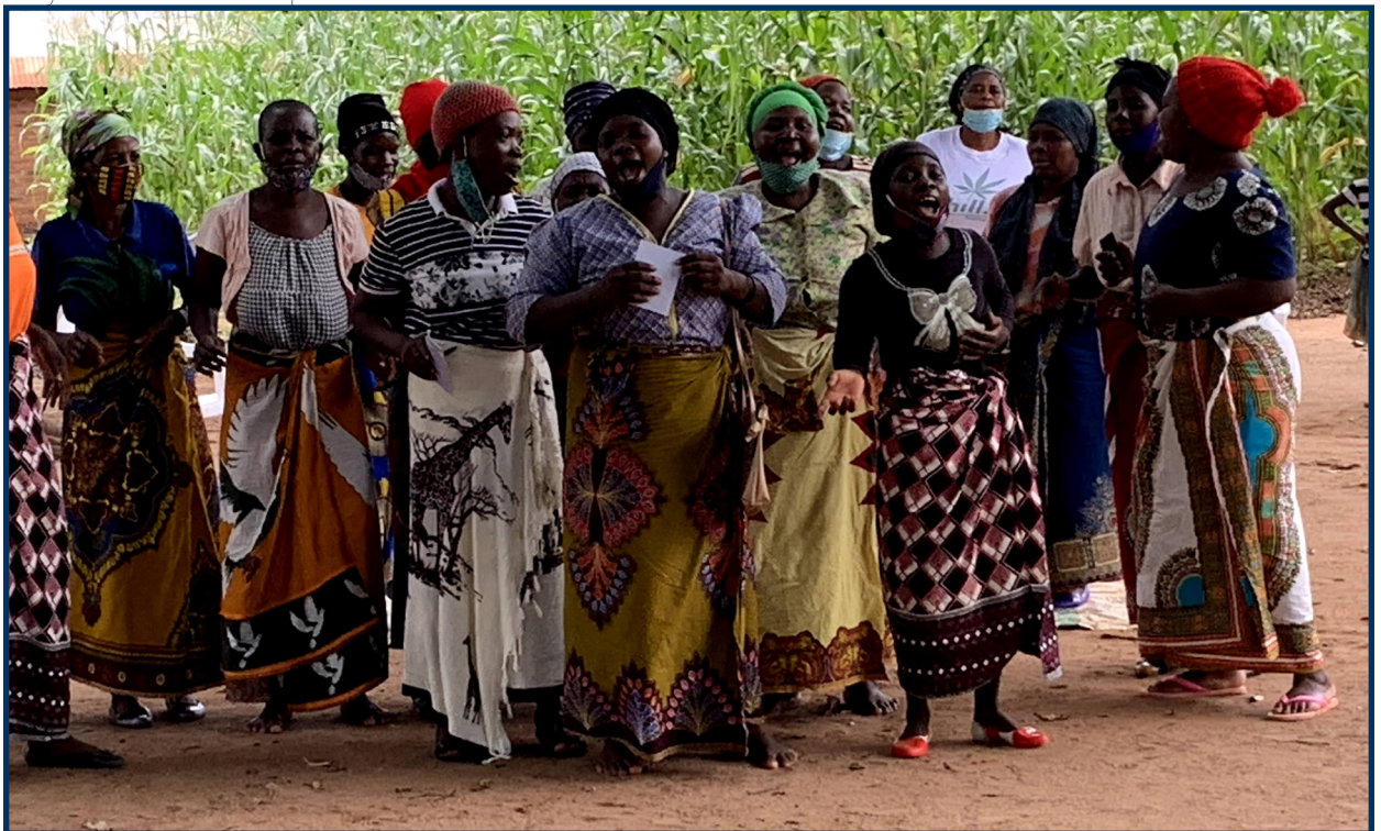
Mayamiko VSL Group

Today, share-out day, is a celebration, as members rejoice at the fruit of their savings, and see how their own hard work and savings resulted in capital gain.