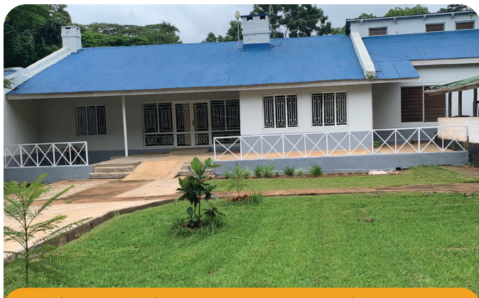
The Discipleship Training Institute Student Center 2021

We are so grateful to all the leaders who have brought Namikango to where it is today. I imagine I won't experience many honors in my life greater than having been able to serve alongside my Malawian brothers and sisters in a long line of God's servants. Sixty years to celebrate indeed! The impact reaches beyond time and into eternity.