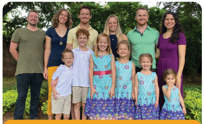
Namikango's American Missionary Team